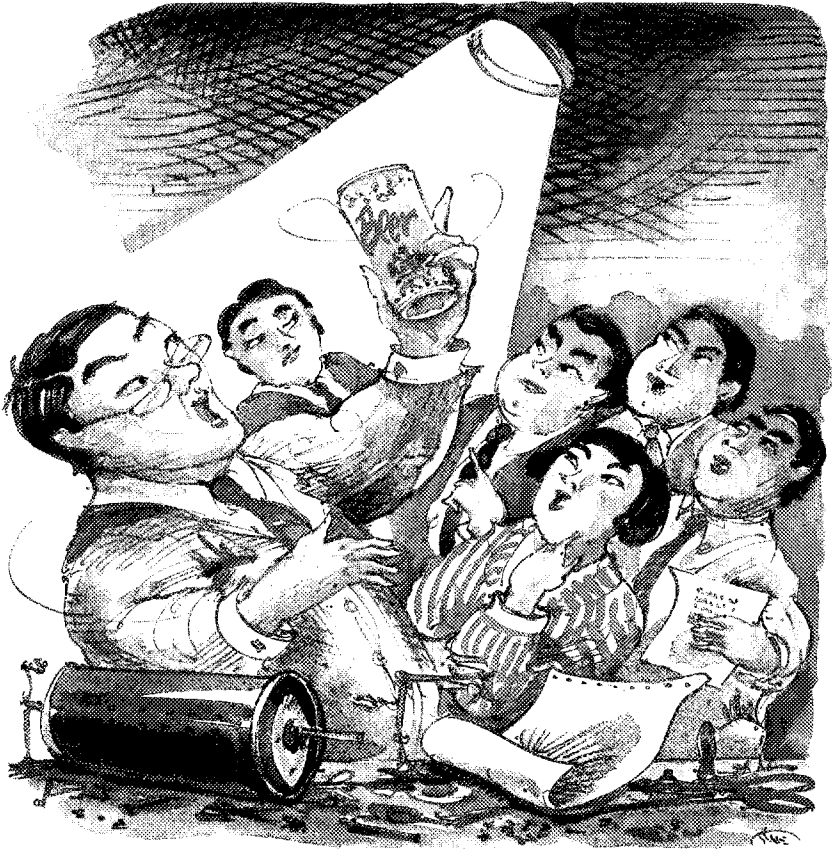
A beer can led Canon to product development by analogy.

Finally, the last step in the knowledge-creation process is to create an actual model. A model is far more immediately conceivable than a metaphor or an analogy. In the model, contradictions get resolved and concepts become transferable through consistent and systematic logic. The quality standards for the bread at the Osaka International Hotel lead Matsushita to develop the right product specifications for its home bread-making machine. The image of a sphere leads Honda to its Tall Boy product concept.