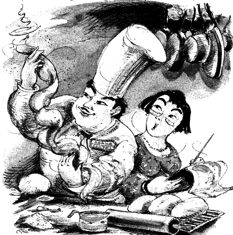
Training with a chef brought tacit knowledge to a Matsushita product.

1. From Tacit to Tacit. Sometimes, one individual shares tacit knowledge directly with another. For example, when Ikuko Tanaka apprentices herself